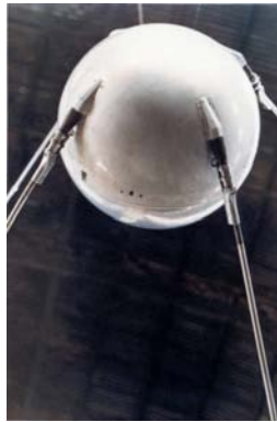
Figure A-1 Sputnik