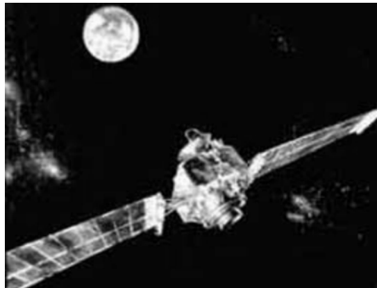
Figure A-6 Hermes Spacecraft

Hermes was the first high powered satellite in orbit which led to present day satellites used to broadcast television directly to individual homes using small low-tech satellite dish antennas.