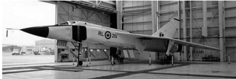
Figure A-4 CF-105 Avro Arrow

The Avro Arrow was developed and proved to be an outstanding aircraft, ahead of its time. Tests flights were started in 1958 by chief test pilot Jan Zurkowski. At the same time, the Astra fire-control and Sparrow missile program were experiencing major developmental problems and creating major cost overruns. The overall costs for the Arrow project were several million dollars and increasing.