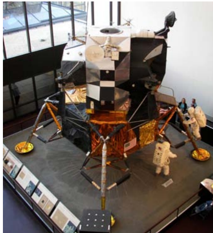
Figure A-5 Lunar Module (LM-2)