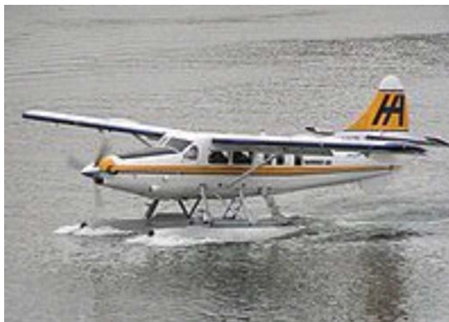
Figure A-12 de Havilland Otter

The Otter first flew in 1951 and was the successor of the DHC-2 Beaver. It was initially called the "King Beaver" but was renamed the Otter. It was like the Beaver but many were converted to turbo-prop Pratt & Whitney or Walter engines.