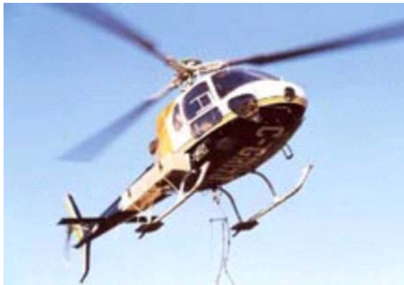
Figure A-15 Helicopter

Note. From "Canadian Bushplane Heritage Centre", 2009, Helicopter . Retrieved December 1, 2009, from http://www.bush-planes.com/detection-aircraft-canadian-bushplane-heritage