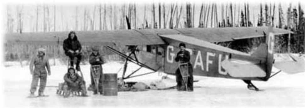
Figure A-1 Fokker Universal

The cooperation and team work of the pilots and mechanics or air engineers kept the far north open 12 months of the year. Unreliable aircraft would leave the crew stranded on a remote lake miles from anywhere with no communications. The skills of the mechanic would make the aircraft flyable or the crew would have to make the long walk out of the bush.