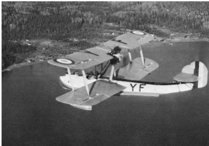
Figure A-3 Vickers Vedette Flying Boat