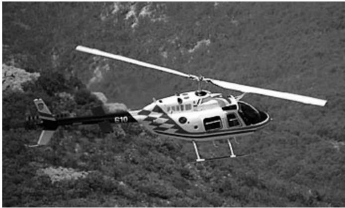
Figure A-17 Bell Jet Ranger Bush Helicopter