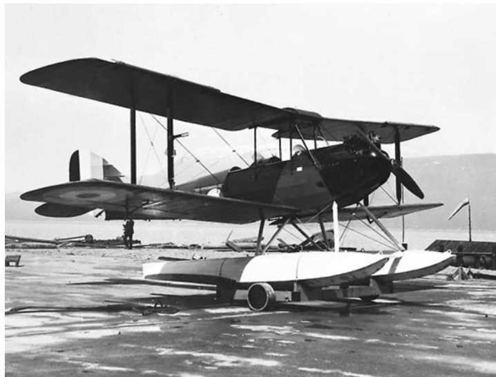
Figure A-4 de Havilland DH-60 Cirrus Moth

The OPAS used the de Havilland Gypsy Moth but the RCAF used the de Havilland Cirrus Moth.