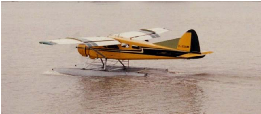
Figure A-11 de Havilland Beaver

The Beaver was designed as a no-nonsense bush plane with a nine cylinder Pratt & Whitney radial engine. The all metal aluminum, semi-monocoque design had tube frame seats and first flew in 1947. The Beaver had short take-off and landing capability (STOL) and could fly with floats or skis. It was known as a "half-ton truck with wings".