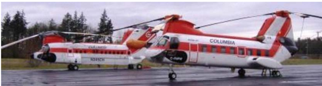
Figure A-19 C47 Chinook Helicopter