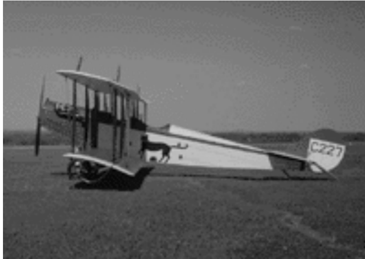
Figure A-5 Curtiss JN-4

Note. From "Canada Aviation Museum", Curtiss JN-4 "Canuck"—Canada Aviation Museum . Retrieved December 2, 2009, from http://www.aviation.technomuses.ca/collections/artifacts/aircraft/CurtissJN-4Canuck