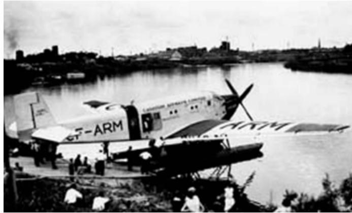
Figure A-8 Junker Ju 52 CF-ARM

Canadian Airways Ltd. flew the Junkers Ju-52 from the Red River. The Junkers Ju-52 was the largest single-engine aircraft operated in Canada and was fondly referred to as the "Flying Boxcar". The single engine aircraft was brought to Canada from Germany and outfitted with a 830 hp Roll Royce Buzzard engine.