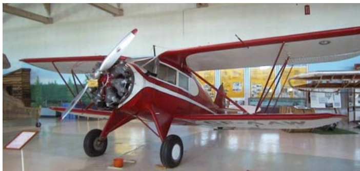
Figure A-9 Waco UIC

The Waco biplane had a cabin for both the pilot and engineer to fly protected from the environment. Up to three people can travel in this aircraft.