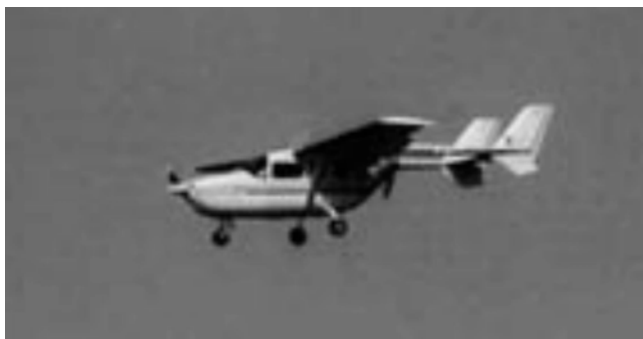
Figure A-14 Cessna 337 Skymaster

Note. From "Creek Side Landing", 2009, Cessna 182 . Copyright 2009 by Old Planes and Cars for Sale. Retrieved December 2, 2009, from http://www.oldplanesandcars.com/inventory