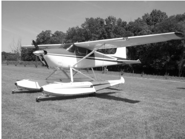
Figure A-13 Cessna 182 Floatplane

The high wing placement allowed the pilot an unobstructed view of the area below. The slow-speed requirement was met by the Cessna, allowing the pilot to observe and report accurately on a fire.