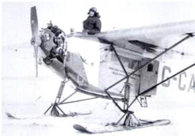
Figure A-7 Fokker Standard Universal

The Fokker Standard Universal was built in 1926. The fuselage and tail surfaces were made of welded tubular steel, covered with fabric. The wings were plywood with a Sitka spruce spar and the engine was the Wright J-4B 200 horse power (hp). The pilot sat in an open cockpit while the engineer travelled in the enclosed cargo section.