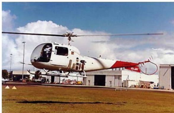
Figure A-16 Bell 47 Bush Helicopter