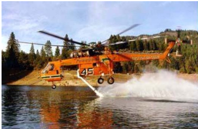
Figure A-18 Sky Crane Helicopter