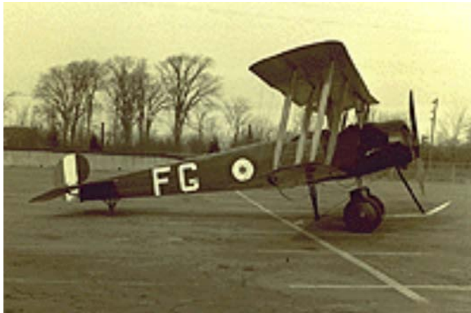
Figure A-6 Avro 504k G-CYFG