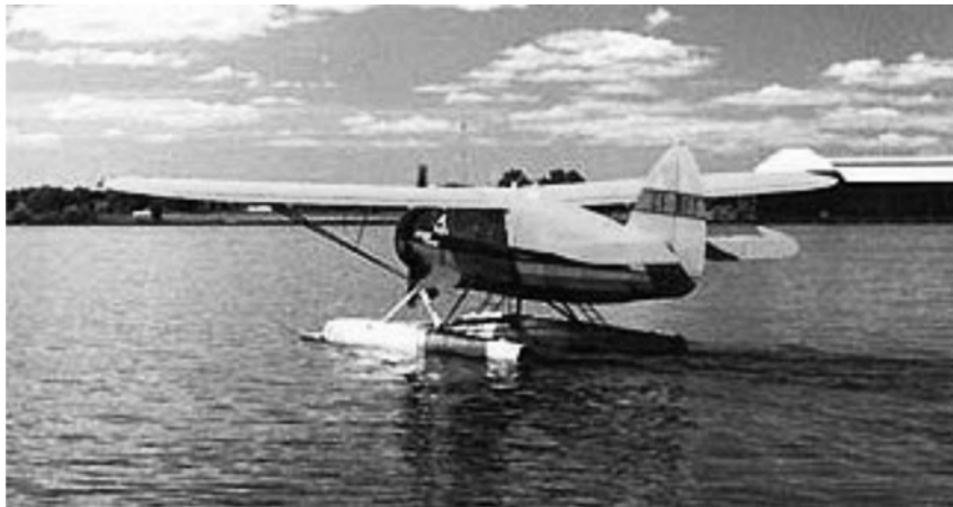
Figure A-10 Noorduyn Norseman

The Noorduyn Norseman is a commercial aircraft designed as a light transport. The Norseman has a Whitney R-1340 radial engine. The design of this large bush plane enabled it to remain in service from 1935–1959 when many were replaced by the de Havilland Otter.