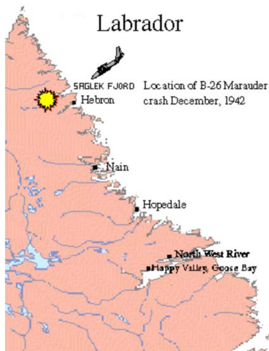
Figure A-4 Crash Site

The weather turned sour and the pilot was forced to crash land at the head of the Saglek Fjord in Labrador. The aircraft sustained minimal damage and the crew survived the impact unscathed. What follows is their efforts to survive in one of the most unfriendly and hostile landscapes on Earth at the worst possible time of year. The diary of the pilot has been retained intact; the last entry added was in February 1943. Except for names and places, spelling and punctuation have been retained as they appeared.