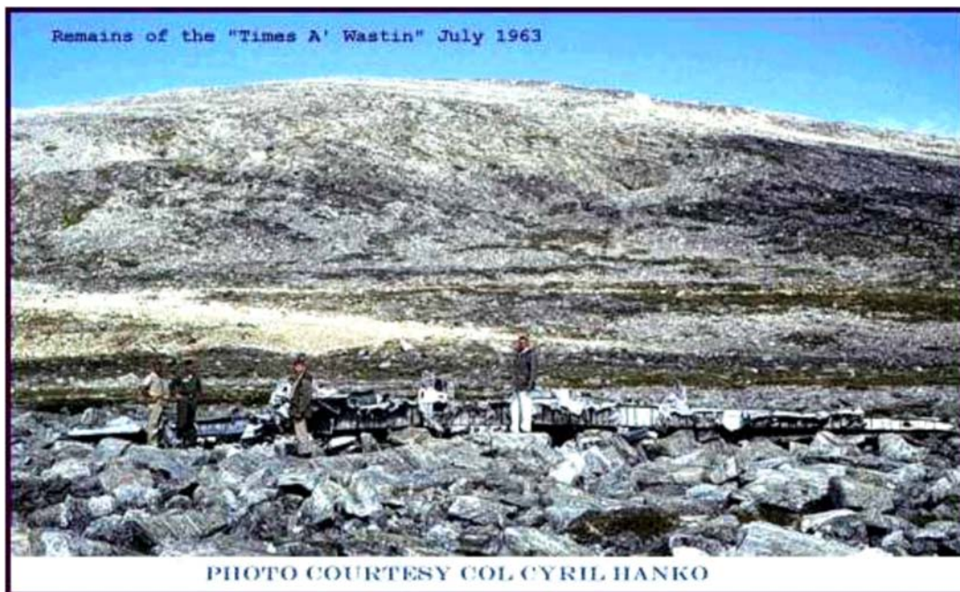
Figure A-1 Remains of the B-26 Marauder "Times A Wastin"

Today, a small United States (US) Airforce converted radar site houses a tropospheric communications link to the northernmost outposts of the hemispheric defence system. From the steep heights, US contractor maintenance personnel overlook the vast stretches of frozen tundra and infrequently visible blue-green of the Atlantic. On a flat stretch of this barren land, at the base of the steep bluff, now crowned by a radome and the concave, billboard antennas of the site, our story finds a setting. No more than 46 m (50 yards) from the present site runway, lie the weathered remains of a B-26 medium bomber of World War II vintage.