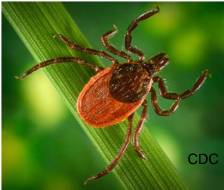
An adult female blacklegged tick waiting on a blade of grass for host.

Ticks are closely related to spiders. They are typically small when unfed, (1 to 5 mm in length), and all active stages feed on blood. They cannot fly and they move quite slowly. Ticks usually come in contact with people or animals by positioning themselves on tall grass and bushes. They may take several hours to find a suitable place on the host to attach to feed. Most tick bites are painless. The majority of bites will not result in disease because most ticks are not infected with the agent of Lyme disease.